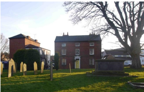
Georgian house in Station Road

Better facilities and services. We believe that the capacity of essential services such as health, education and drainage should be increased in step with any new developments within East Leake and surrounding smaller villages, and will press hard for this. Further, we wish to improve facilities for young people, and in particular provide more activities for teenagers