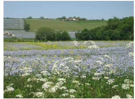
...surrounded by hills

East Leake is largely self-contained and acts as a hub for surrounding smaller villages. It has a historic centre at one end of Main Street and a contrasting, more modern shopping centre at the other. There are a wide range of services and a good selection of shops in the village, plus considerable employment, especially at British Gypsum.