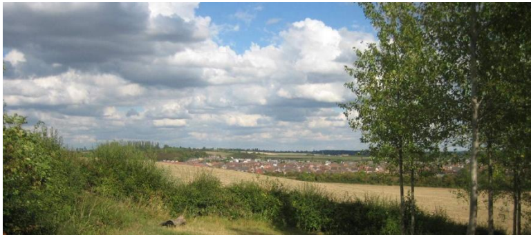
East Leake set in a green hollow...

East Leake is a rural village in south Nottinghamshire, set in a green hollow surrounded by hills. The built area is divided through the centre by a green wedge, the result of the Kingston Brook and its associated floodplain. Over the last half century, it has grown rapidly from being a linear village at the junction of roads that emanate north, south, south-west, east and west, to being a much larger settlement of some 6000 people. It is very well connected to the rest of the East Midlands region and beyond, being close to Loughborough, Nottingham, Derby and Leicester, and having motorway, rail and airport links within a few miles of the village.