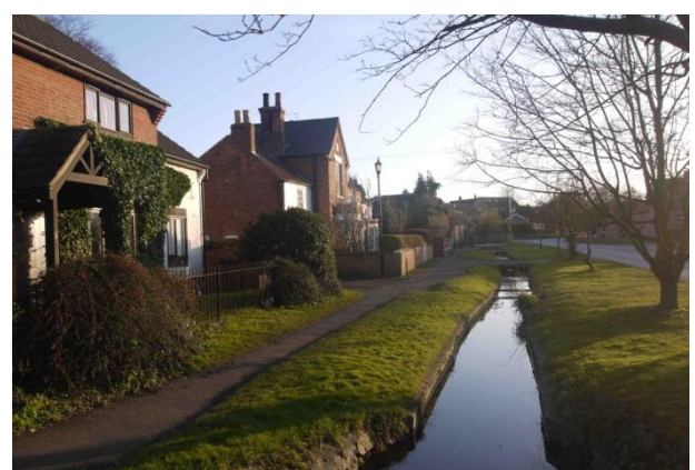
Sheepwash Brook on Brookside