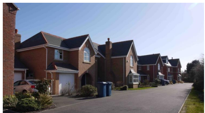
New private housing at Osier Fields

Housing for all. We are concerned that recent new housing developments have been mainly targeted at well-off families; our aim is to maintain the diversity of the village population by ensuring that new housing is provided for young people, lower income families and older people. We will restrict new housing to sites within walking distance of the village centre, and will ensure that its character is sympathetic to the local tradition in terms of materials and scale. We will encourage smaller scale housing developments on infill sites in preference to large-scale estates on green field sites. We will encourage and support improvements in the quality and energy efficiency of older housing.