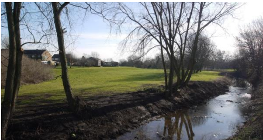
Green wedge dividing the village

Maintaining the green environment. We wish to conserve and enhance the rural character of the village, and to preserve the ring of green undeveloped hills surrounding the village. Further, we intend to exploit and enhance the network of informal green spaces within the village, so that they support attractive pedestrian and cycle routes connecting the different parts of the village.